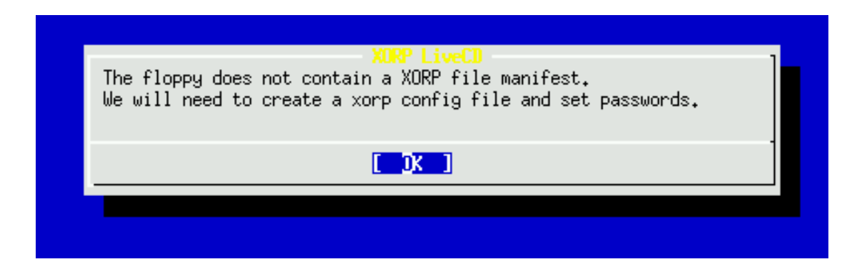
Figure 18.3: LiveCD floppy-related message

Hit Enter, and you will be prompted to enter the root password for the FreeBSD system. This will allow you to login to the machine as the superuser to diagnose any problems, or to see how XORP works behind the scenes.