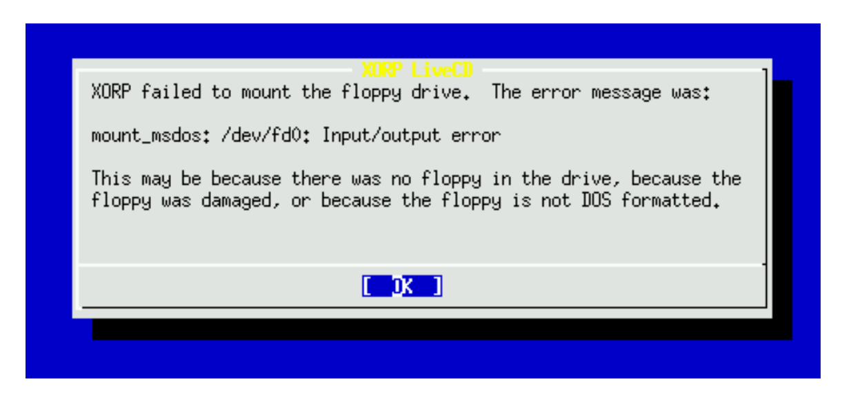
Figure 18.1: LiveCD missing floppy-related warning

The startup script that runs the first time you run XORP is quite simple. If there's no floppy in the floppy drive, or it's not DOS-formatted, you'll be presented with a warning similar to the one in Figure 18.1.